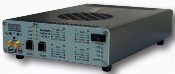
BusXpert Micro II SAS/SATA Analyzer