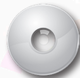
BusXpert Software Installation CD